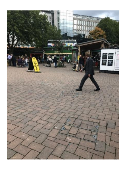
Figure 9: Presence of people improves safety perceptions in the Bearpit

Yes, definitely. When everyone is there, I feel much more relaxed than when it is just people hanging around.