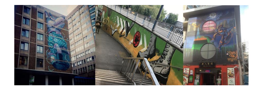
Figure 6: Participants' photographs representing interest in street art

Finally, the details of historic architectures triggered fascination, imagination, and positive affective appraisals in some participants (Figure 7). For example, Julia commented an old building that stimulated positive affective appraisals and a soft distraction, making her feel engaged and comforted: