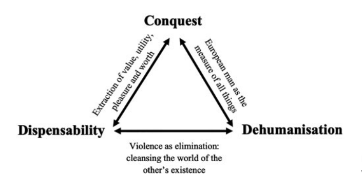
Figure 1. The decolonial triangle of violence.

committed by the Nazi regime in Europe had been preceded and instructed by centuries of similar forms of violence in colonial settlements. In his understanding, the Holocaust was not rendered horrific because it constituted an offense to the very idea and essence of humanness, as Hannah Arendt would have it.<sup>60</sup> The Holocaust was experienced as grotesque because, for the first time, the old colonial procedures that 'had been reserved exclusively for'<sup>61</sup> the victims of European colonialism were employed on Europeans themselves.