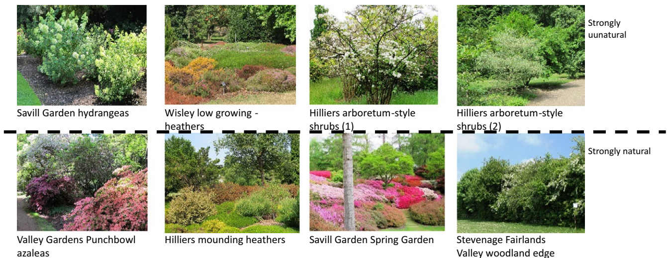
FIGURE 3 Images of the shrub sites used in the study, showing the two levels of planting structure: strongly unnatural and strongly natural

other species, resulting from deliberate planting or placement. In the case of woodland (Figure 2) and herbaceous (Figure 4) planting all three structures were represented. In the case of shrub planting (Figure 3), where diversity of form in designed green spaces is less varied, two were represented, with the