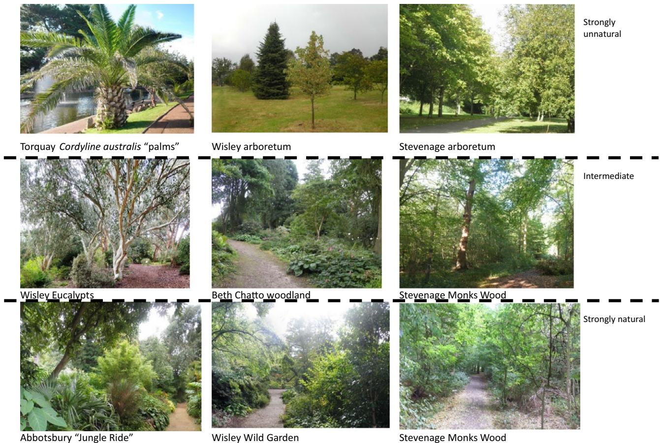
FIGURE 2 Images of the woodland sites used in the study, showing the gradient of planting structure from strongly unnatural to strongly natural