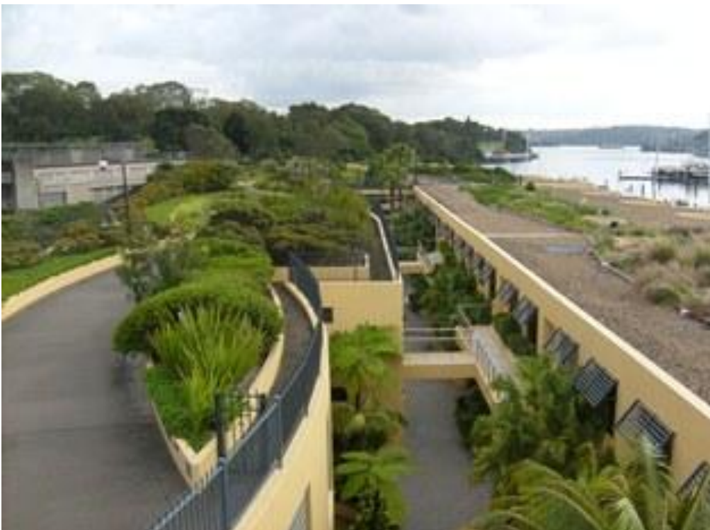
Plate 2 Wharf Terrace Woolloomooloo Sydney - intensive green roof