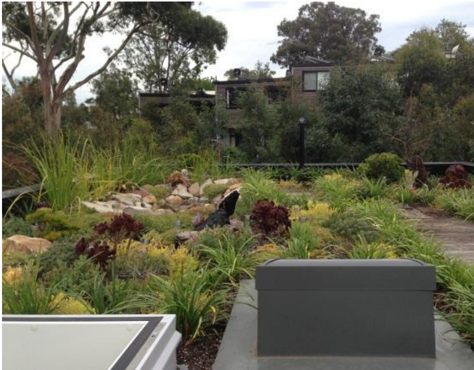
Plate 1 Foss Street Sydney - extensive green roof