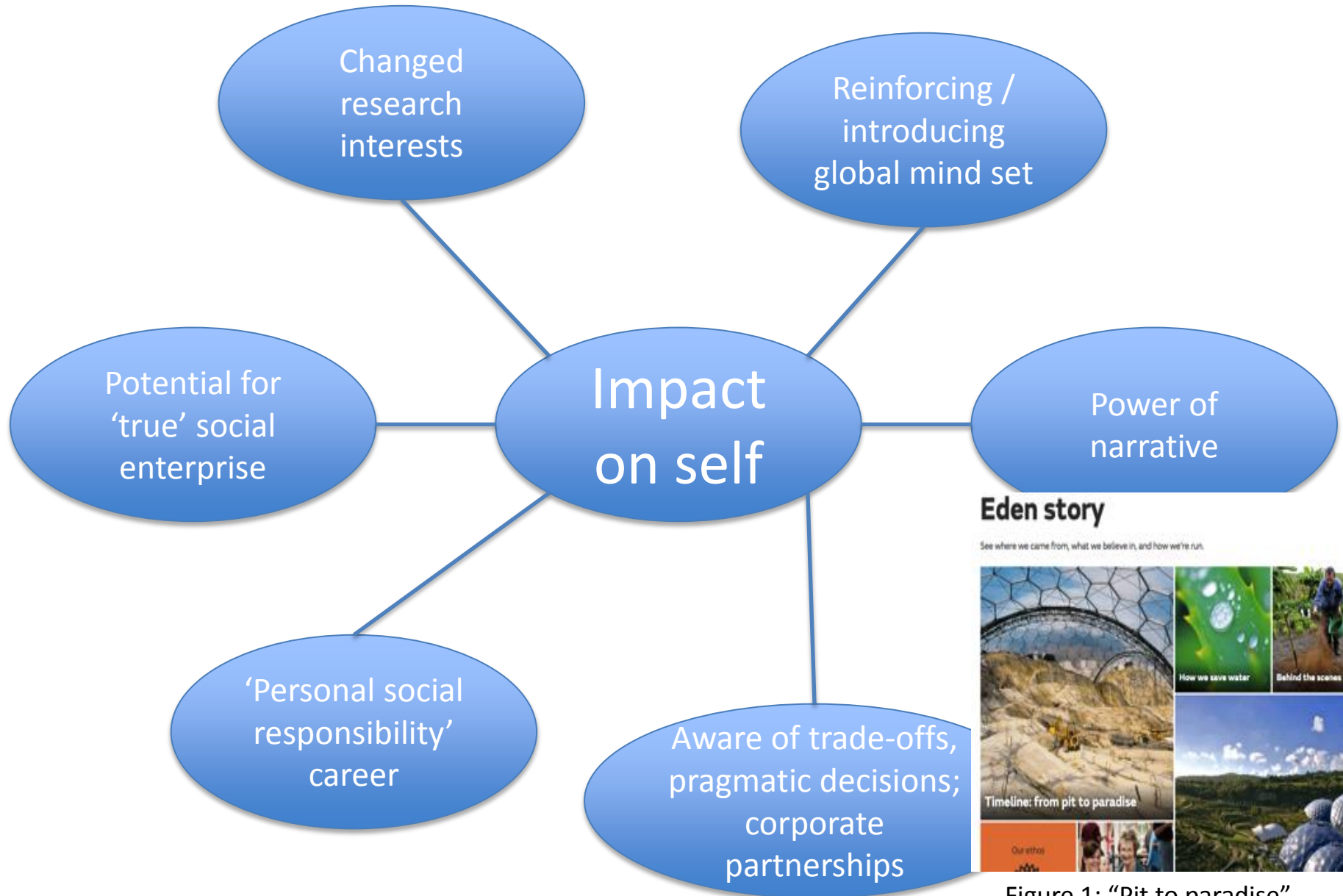
Figure 1: "Pit to paradise". Official Eden Project website