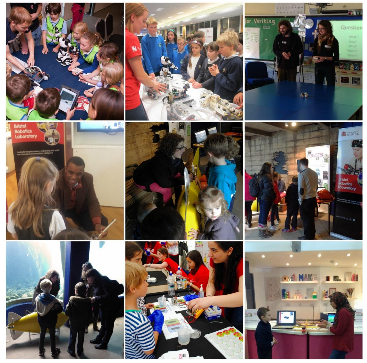
Permissions were obtained for all photos shown in this report.

'Robots vs Animals' was a creative collaboration between engineers and zoologists, exploring the ingenuity of both nature and humankind. The project was organised and managed by the Science Communication Unit at the University of the West of England, Bristol (UWE), and funded by the Royal Academy of Engineering Ingenious Awards. The project communicated the stories of the engineering design process taken by Bristol Robotics Laboratory (BRL) engineers to create biologically inspired robots. Interactive sessions at Bristol Zoo Gardens and other public venues and events featured engineers and zoologists explaining and demonstrating the skills and processes of their respective charges.