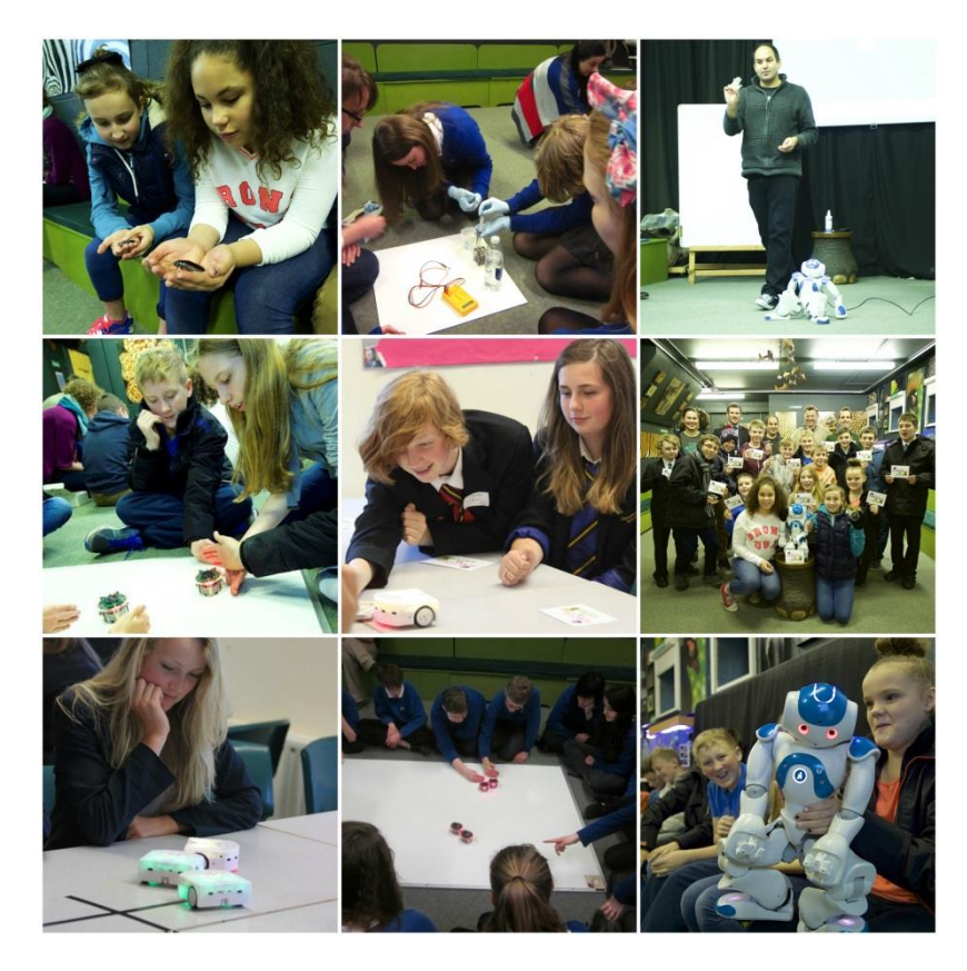
"Thank you for coming to our school and showing us your wonderful robots. When I grow up I want to be one of you!" (Child, aged 7).