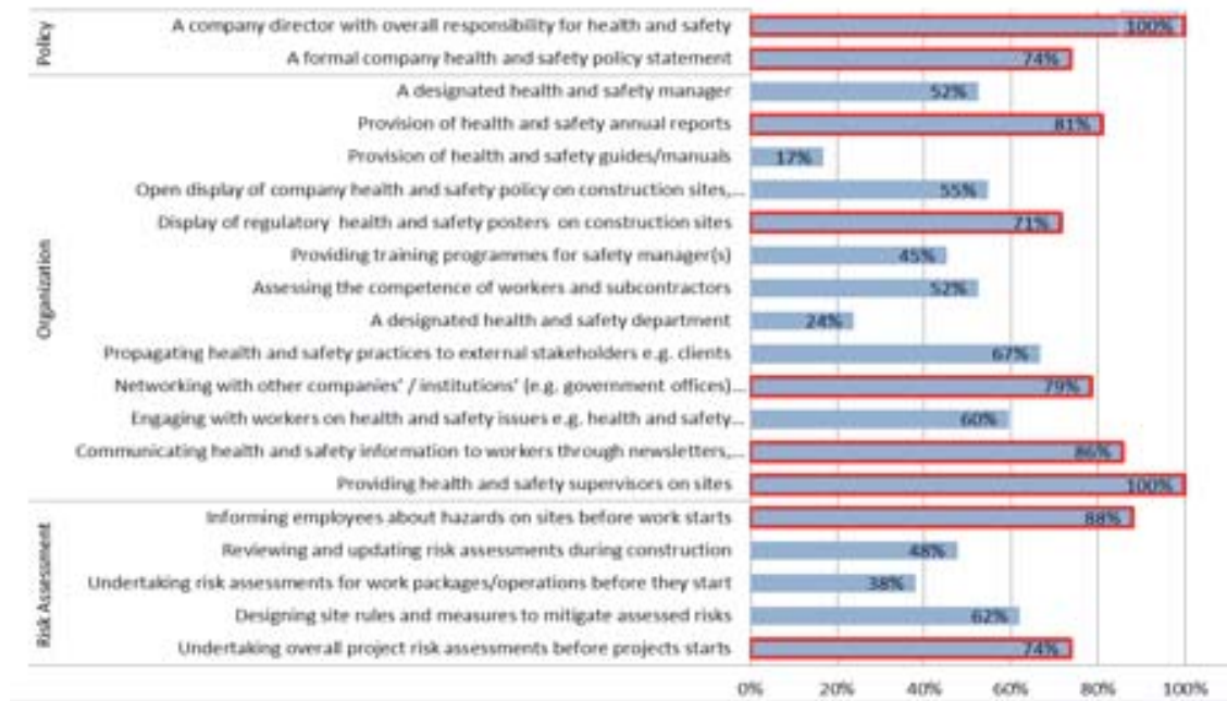
Figure 1: Level of Implementation of H&S Management Practices

The findings and discussion presented here focus on practices within the policy, organisation and risk assessment areas/elements of H&S management. The findings are summarised in Figure 1 below.