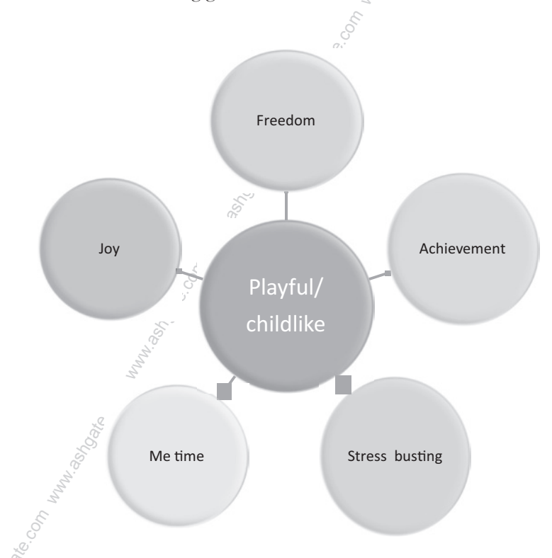
Figure 9.3 Qualitative research findings with non-cyclists: Possible benefits of cycling Copyrighted Material

The first part of our research was a qualitative project that explored the barriers and motives of non-cyclists with respect to cycling (Leonard and Spotswood 2010). We found that some of the non-cyclists' barriers to cycling were actually quite weak, not particularly deep seated, and hence not difficult to overcome. Attitudes that we recognized as being vulnerable to counterpersuasion included the following: 'It takes too long to get to work', 'I get sweaty', and 'It's all busy roads'. We decided that changing the perceptions about these attitudes may best be achieved through personal discussions; for example, through workplace talks from travel planners, or through personalized travel planning initiatives. Similarly, we found that positive attitudes and beliefs about the benefits of cycling that were created in childhood were often buried or forgotten (see Figure 9.3) and we considered how there would be value in stimulating their re-emergence – particularly feelings of wellbeing, or the satisfaction felt on achieving goals.