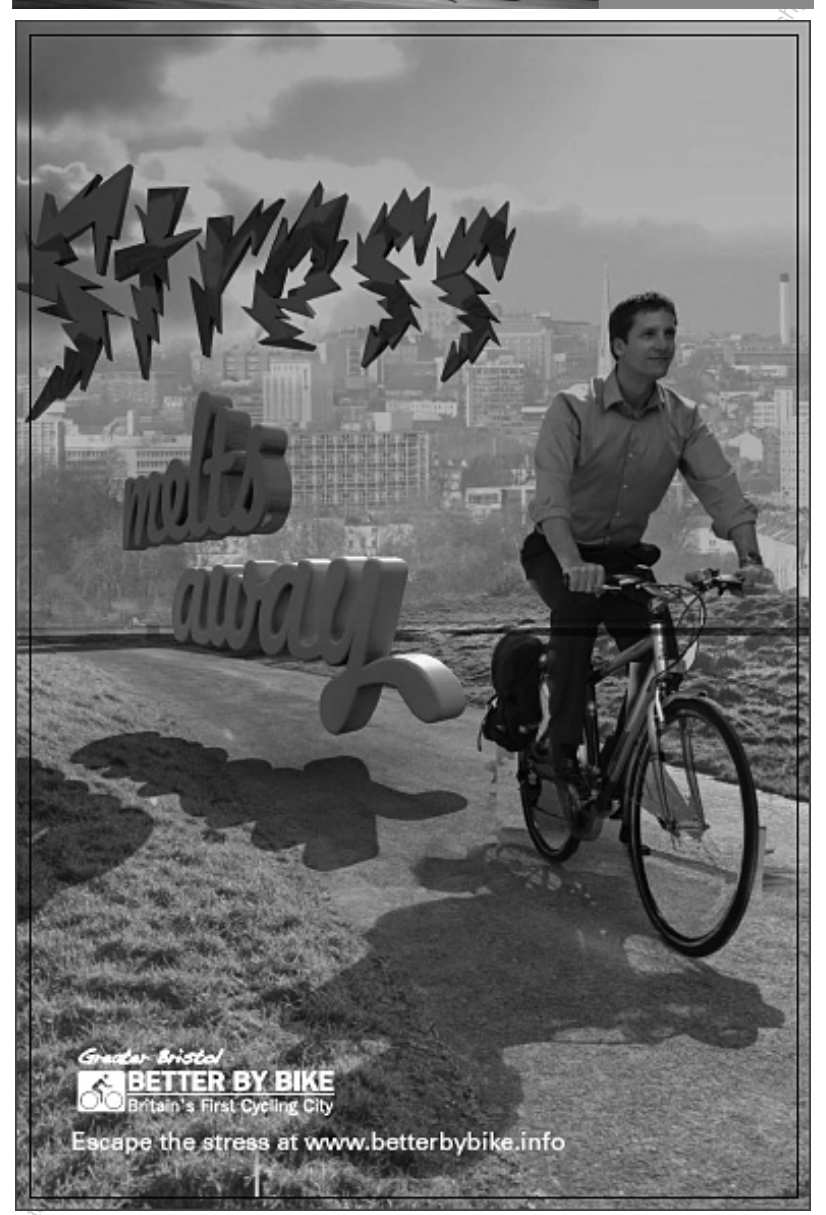
Figure 9.4 Cycling Brand campaign execution (left and above)