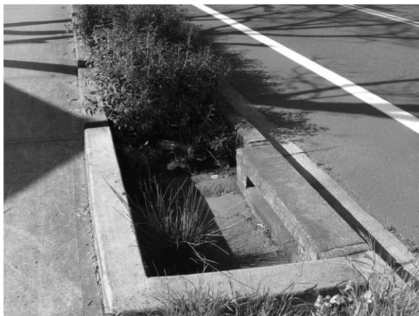
Figure 1 Incomplete bioswale showing water inlets.

scoring for sustainability efforts in Portney's (2013) review of US cities (see also Mayer and Provo, 2004).