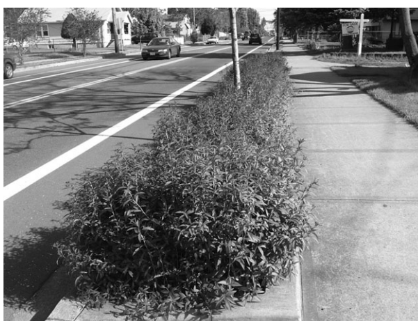
Figure 4 Bioswale not extending into the road.

'It occupies a traffic lane which is also a parking lane. So it's taking away traffic when it's designated to drive and parking in the evening. These are residential-