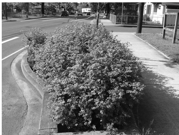
Figure 3 Bioswale extending into the road.

This is significant, since positive shifts in opinion seemed possible when the purpose and function of the devices was explained, face-to-face, in lay terms: