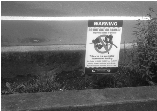
Figure 5 Incomplete bioswale with Bureau of Environmental Services sign warning against interference.

The city does have a volunteer Green Streets Stewards (GSS) programme, training people to know which plants should be in the bioswales and to trim and weed them (BES, 2012, 2013). Whilst they do not want untrained residents weeding (see Figure 5), they encourage people to clear out trash and debris to improve functionality (BES, 2012).