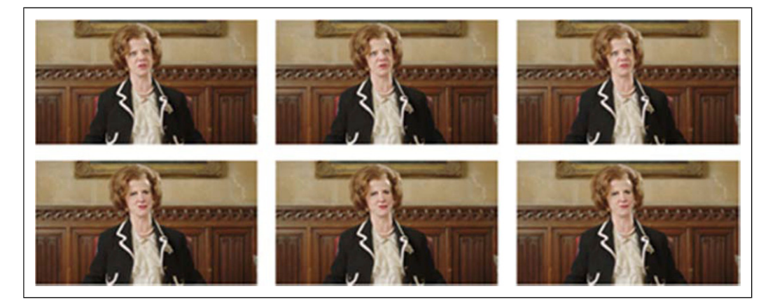
Figure 7. Three consecutive frames showing the original images at the top and the swapped images at the bottom.