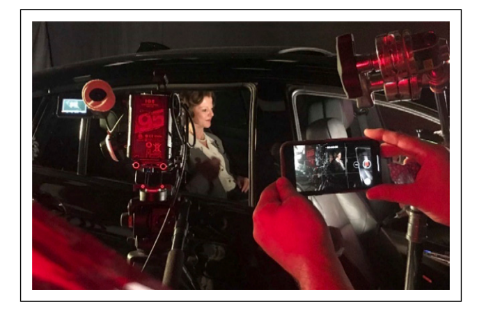
Figure 3. Interior car scene - preparing side angle shot for Virtual Maggie.