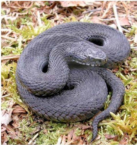
Figure 1. Melanistic V. berus.