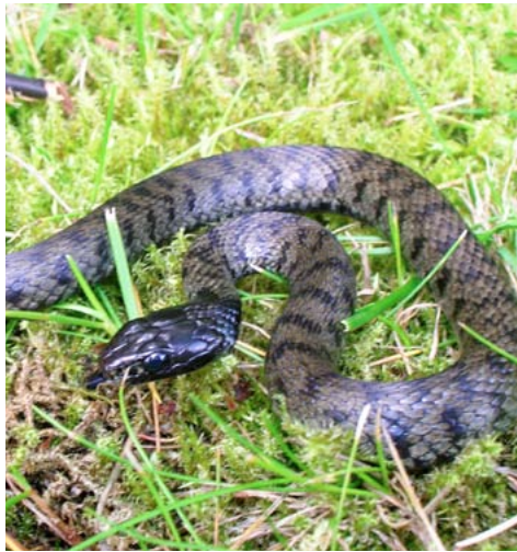
Figure 2. Melanistic N. n. helvetica.