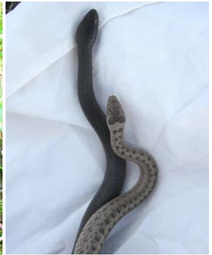
Figure 3. Melanistic C. austriaca next to a cryptically coloured specimen.

The earliest record of a melanistic smooth snake in Britain dates from the 19th century and until recently was considered an anomaly (Cambridge, 1894). More recently there have been further records (Pernetta & Reading, 2009; Woodley, 2015) increasing the total to four, all from Dorset (Fig. 4).