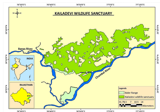
Figure 1. Map of Kailadevi Wildlife Sanctuary

purposes, KWLS is divided into four Ranges: Kela Devi, Karanpur, Mandrail and Nainiyaki (Forest Department, Rajasthan, 2015).