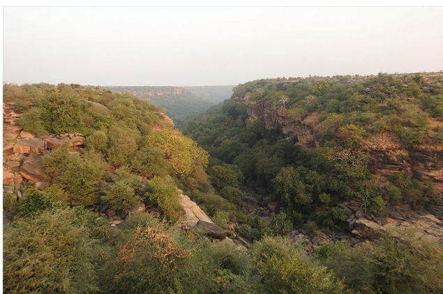
Deep gorges (khoh) host rich, moist forests

Vegetative cover elsewhere in KWLS is relatively sparse. Dhonk ( Anogeissus pendula ) is the dominant tree, constituting 80 per cent of vegetation cover. Forests adjacent to villages and the forest boundary are reduced to stunted shrubs through anthropogenic pressures (Forest Department, Rajasthan, 2015; Thorat & Gurjjer, 2010). Larger fauna includes predators such as Leopard ( Panthera pardus ) and herbivorous prey populations including various deer species. For management