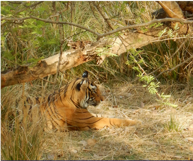
Tiger in cover in Ranthambhore National Park

ecosystem service benefits across a spectrum of geographical scales whilst also reducing other services.