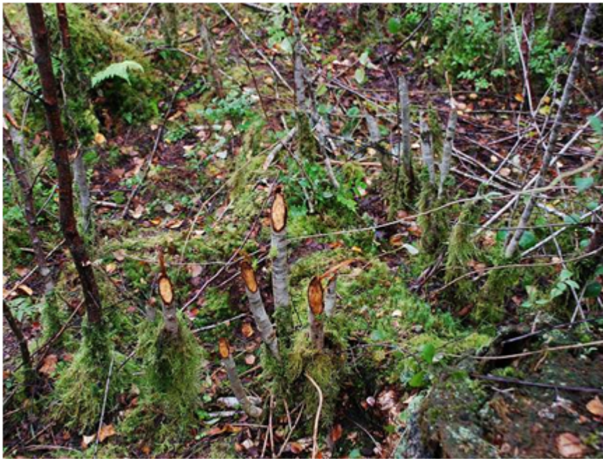
Figure 3: Birch felling by beavers

The trial lasted five years and, despite expected hiccups and a challenging start, was an overall success. In 2010 the first beaver kit was born, and today the Scottish beaver populations remain relatively stable. In 2016, two years after the conclusion of the trial, the beavers were granted "native species" status by the Scottish government, ensuring their continued protection.