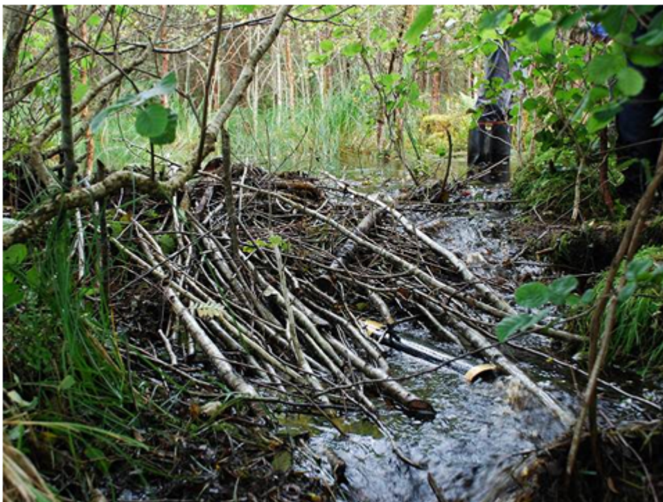
Figure 2: Beaver dam

All over the world, species are dying at an unprecedented rate. As such, it has become generally agreed within the realm of natural sciences that we are already living through or, at the very least, hurtling towards the sixth mass extinction: an era characterized by the extensive loss of life on Earth. Consequently, it is also a time in which stories of sorrow and grief have come to dominate the narratives surrounding humans' relationships with nonhuman others. A direct response to the loss of species in this time of increasing extinction is the practice of rewilding. Rewilding seeks to restore species in their original locations, in the hope of reinvigorating both the species and the habitats in which they live. However, contemporary rewilding projects are not seeking to return environments to their historic states. Rather, as Monbiot (2013) explains, through the reintroduction of species to an area, rewilding seeks to allow the natural environmental processes of that area to resume, unhindered and uncontrolled by humans. One such example of rewilding is that of the "Scottish Beaver Trial" project, a five-year venture that sought to successfully reintroduce beavers into Knapdale Forest, Mid-Argyll. The project started in 2009 and was led by the Scottish Wildlife Trust, in partnership with the Royal Zoological Society of Scotland and the Forestry Commission Scotland.