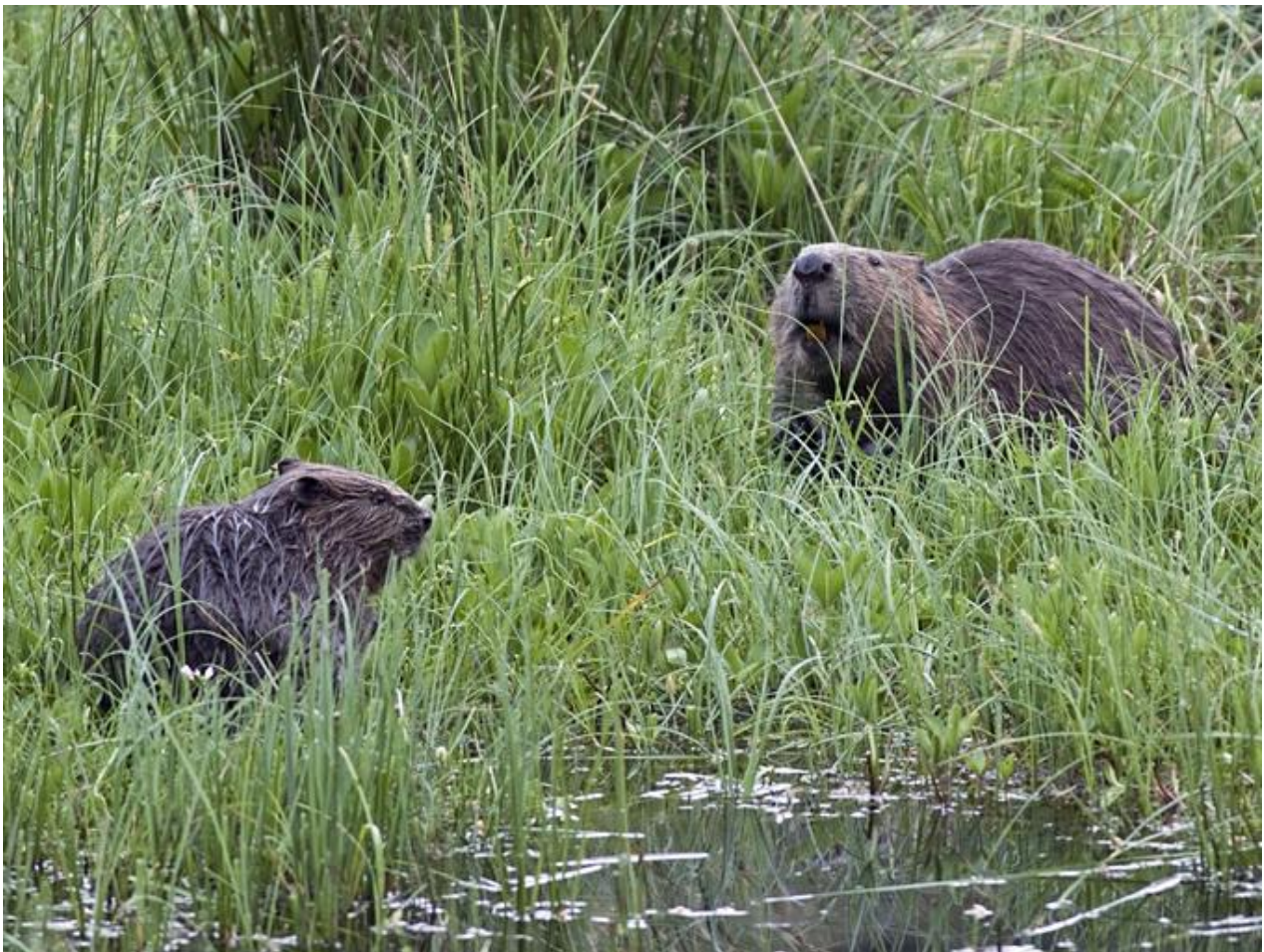
Figure 1: Tayside beaver mother and kit

This story follows the work of the “Scottish Beaver Trial,” a five-year project that sought to restore beaver populations in Scotland. The trial began in 2009, when three families of beavers were released in Knapdale Forest in the hope that they would make it their new home. After a challenging start the beavers managed to thrive in their new environments, transforming the landscape and increasing biodiversity. Two years after the trial concluded, the beavers were awarded “native species” status, ensuring their continued protection. The trial demonstrates the potential of rewilding projects to offer hope in an era of environmental instability.