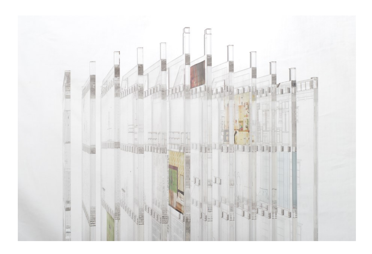
Figure 1. 'Undressing UK Housing' architectural model.