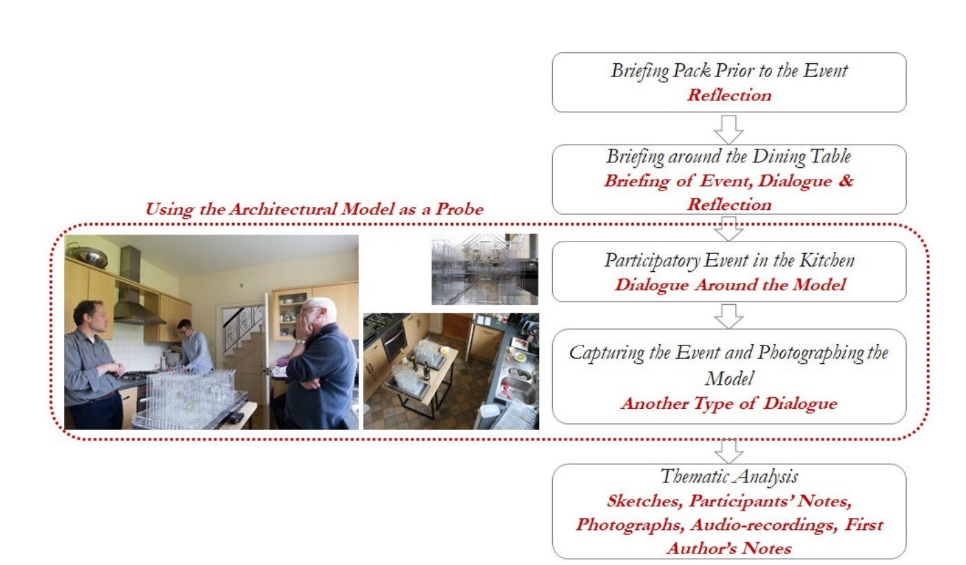
Figure 5. The five stages of the method.