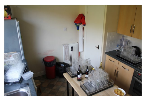
Figure 8. Photographs of the kitchen after the domestic event finished.