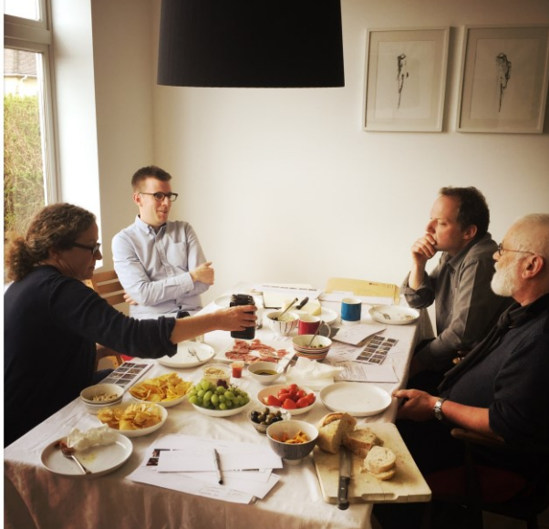
Figure 3. Participants being briefed in the living area as part of the domestic event.