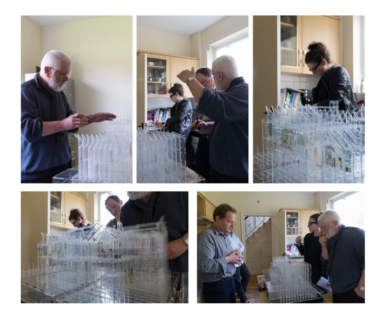
Figure 6. Participants during the domestic event.

model of space', in which participants might 'play' at placing various items of 'clutter'. Another suggestion was to use a 'digital' or 'cinematic' model that could be morphed with time so as to become temporal, like material possessions are themselves. A theme that kept occurring was the importance of playfulness as a means of engaging the participants that take part in the sensory ethnography.