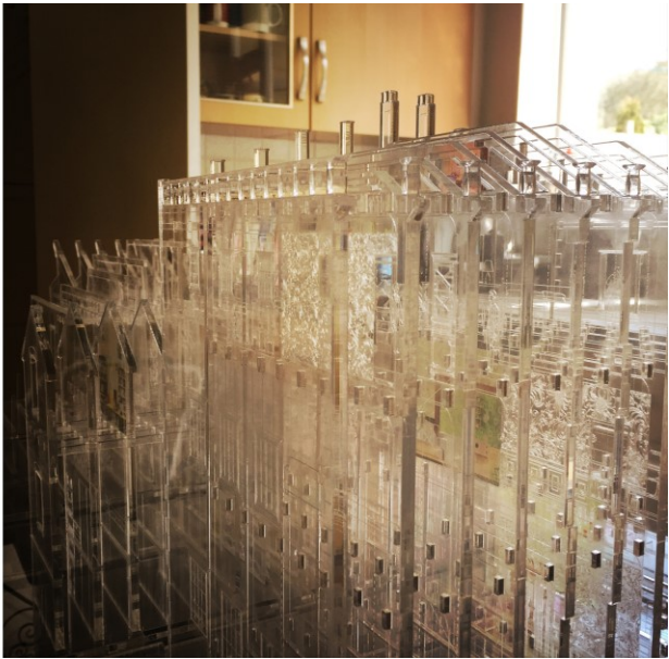
Figure 4. Placing the architectural model in the context of the kitchen.