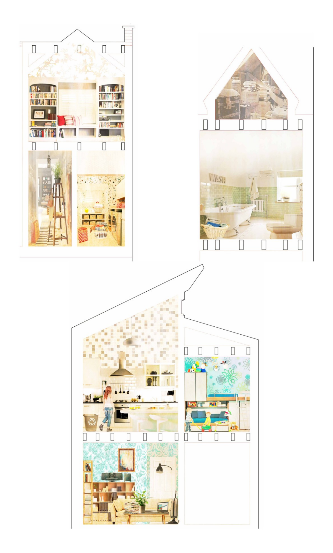
Figure 2. Example of the model collages.