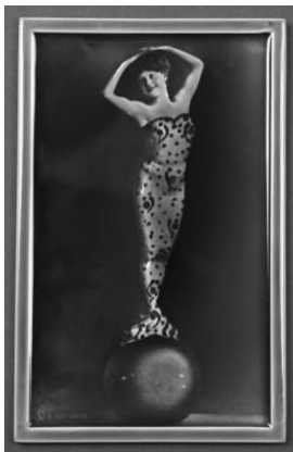
Figure 10. Fired Glazed CNC milled photoceramic tile

The project will then move on to use a Mitsubishi robot to both extrude the clay paste and to mill the surface to a fine enough standard for a commercial ceramic prototype.