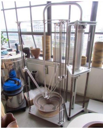
Figure 5. Olivier van Herpt

Several systems have been commercialised, one of the most well-known being the WASP system. WASP are a supplier of extrusion 3D printed ceramic systems using Delta printers they have scaled the concept up to a four-metre-high printer that is capable of printing large structures.