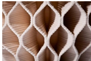
Figure 4. Unfold-fab 3D ceramic extrusion print

In Belgium Unfold-fab were an early contributor to the art and have continued to develop and improve both the extrusion system and the 3D printers.