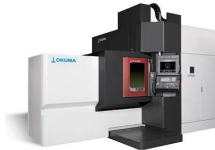
Figure 7. Okuma MU-8000V Hybrid System

Considerable progress has been made in the area of Hybrid (i.e. sequential Additive and then Subtractive operations) 3D manufacture, the main driver for these processes has been in metal 3D printing and machining, companies such as Okuma are marketing integrated machines the MU-8000V system IMAGE that combines Metrology and Laser Metal Deposition IMAGE with CNC machining to both repair existing objects and to create new models.. Hybrid Manufacturing Technologies also market similar systems.