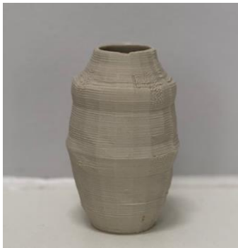
Figure 2. CFPR ceramic extrusion 3D print 2009

One proposed solution to this problem is to revisit the process of 3D printing ceramics by extruding a ceramic paste. This type of system has been available since low-cost FDM type printers emerged in the mid-2000s. The Centre for Fine Print Research amongst many others developed a ceramic 3D printer using a syringe and compressed air system to extrude clay paste to produce effectively, digital coil pots; this system was one strand of a successful CFPR research project to develop a self-glazing 3D printed ceramic body.