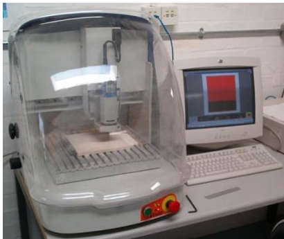
Figure 9. CNC milling clay tile 2003

By machining the surface of the formed ceramic object it should be possible to remove the coarse layering effect of the extrusion process to give a smooth finish to the surface. The Centre for Fine Print Research CFPR University of the West of England UWE has considerable experience of direct milling of unfired ceramic tiles for the production of photo ceramic tiles in an earlier project conducted in 2003