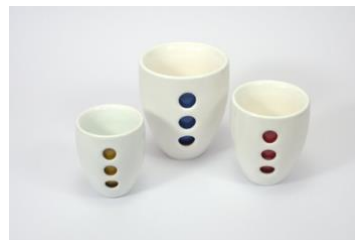
Figure 1. 3D printed ceramic double walled beakers produced at UWE

3D printable ceramic materials for the Z Corporation machine platforms have been developed separately by Tethon 3D and the Centre for Fine Print Research team at the University of the West of England who have available a Tri-axial porcelain 3D printing material that replicates the characteristics of conventional porcelain. Allowing both conventional designs to be produced and giving the opportunity for previously impossible to make concepts to be realised.