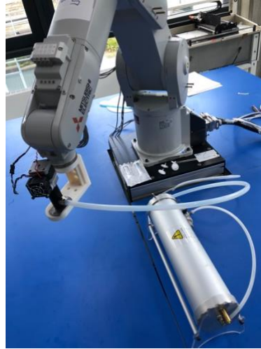
Figure 11. Mitsubishi robot arm with WASP extruder

The ultimate aim is to develop a system to produce hi-fidelity industry standard ceramic prototypes and short run production of high value objects.