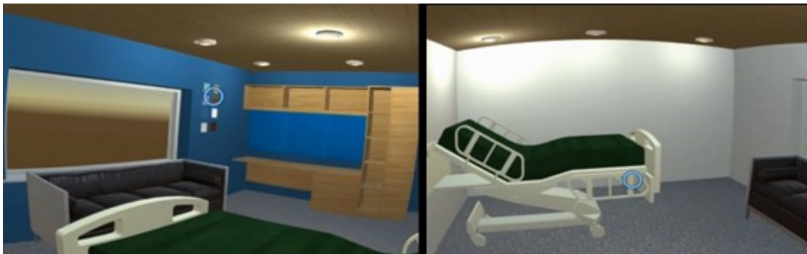
Fig. 2: Screenshots of Scenes in the Interactive Care Facility Design User Engagement VR System