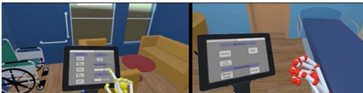
Fig. 3: Screenshots of virtual-tablet user-interface for object manipulation and interaction in the VR System