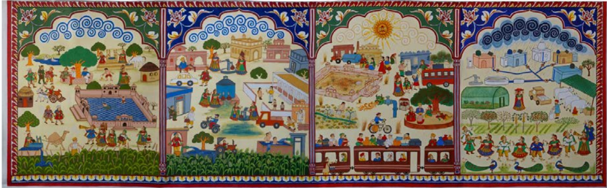
Figure 6. The scroll depicting Jhakhoda's water history and possible future.

and Kharif crops; the village appears to be in harmony with nature and the climate. Peacocks have also returned, which, according to Indian folklore, signals the coming of monsoon rains and the replenishment of water.