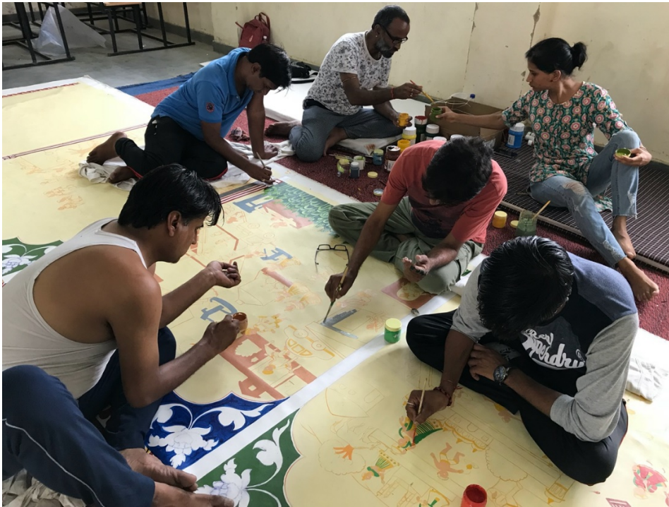
Figure 5. Phad painters working on the scroll.

As the quotes above indicate, the work in Jhakhoda provided a means for the artists to move outside of conventional painting traditions; it also allowed them to bring their art form into new contexts.