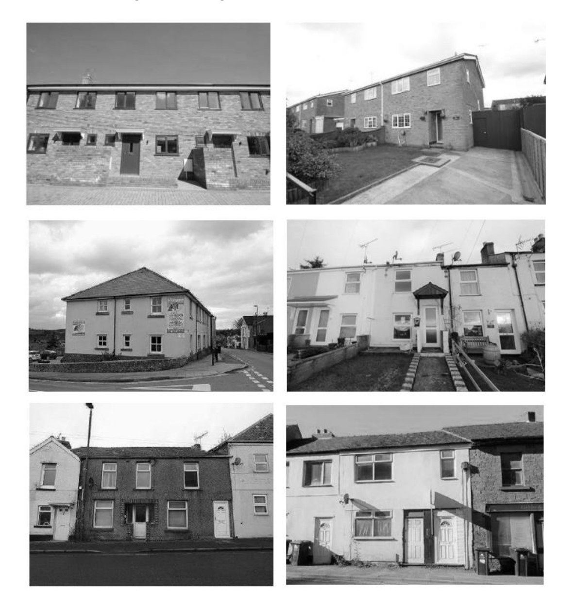
Figure 1: Housing in the areas of Denecroft and Hilldean<sup>13</sup>

Each area has a somewhat different demographic make-up. Denecroft has an elderly population, with a lot of supported housing, bungalows and a day care centre. Hilldean has more single-parent and young families, and is over 60% social housing.