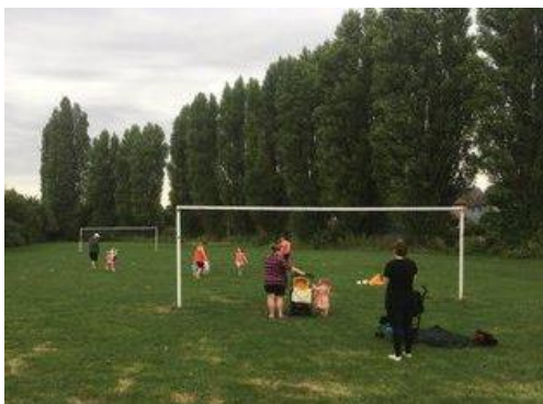
Figure 3: Photos illustrating project activities