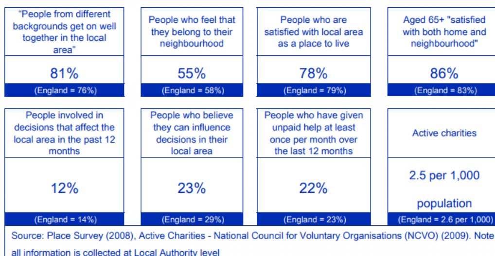
Figure 1: Indicators of neighbourhood satisfaction and community cohesion 10

Figure 1 shows self-reported data taken from the Place Survey (2008). The top row are indicators of community strength, the first three boxes in the bottom row are indicators of civic engagement i.e. volunteering and political decision-making, and the box on the far bottom right shows the number of active charities per 1,000 population.