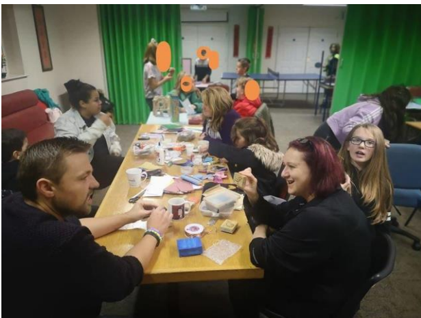
Figure 5: Kingzone Kids

Myself and the other two people who help, had a meeting, trying to think of ways to keep this community project going. I've learned [that] I can be tenacious when I'm passionate about something. It has helped my son with socialising, as he has Asperger's. Another parent said it has helped her daughter and her other children, [and] she feels her children are in a safe environment. I'm hoping this will be able to continue as it has been so refresh[ing] watching children from 10-15 years all bond together and become relaxed, and [their] acceptance of others regardless of disabilities."