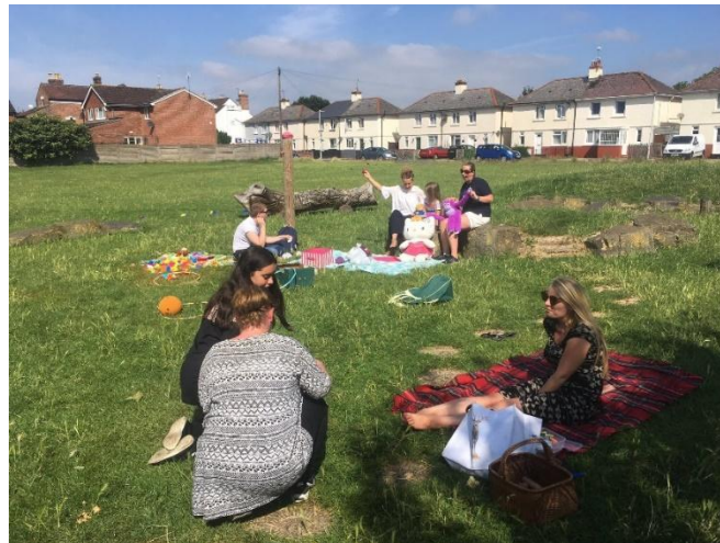
Figure 4: Teddy Bears Picnic, summer holiday 2019