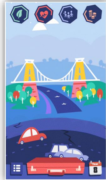
Figure 3-2: ClairCity’s Skylines interface

In addition to the Citizen Delphi previously mentioned, the Citizen Led Air pollution Reduction in Cities project, ClairCity, created a web-based game downloadable for use on iOS and Android devices. The Skylines Game puts citizens in the shoes of the city mayor with the challenge to balance environment, economy, health, and satisfaction by implementing policies that were derived from the Citizen Delphi process. The purpose of the game is to help to raise awareness of air quality but also illustrate the trade-offs that policy-makers face in protecting public health. The crowd-sourced results from the policy selections made by players were collated and, together with the Citizen Delphi and other stakeholder input, were used to inform the development of the citizen inclusive Policy Packages for each city. Additionally, the data from the Game can be used to understand the factors that influence people’s decision making and preference for particular interventions such as environment/health, personal satisfaction, economic cost (Hayes et al., 2018).