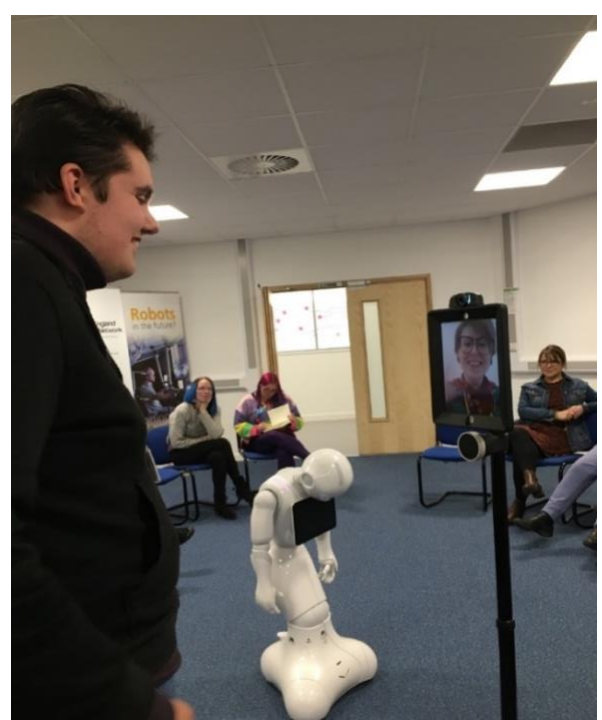
Figure 2 I am a part of the café, even though I am apart from the café