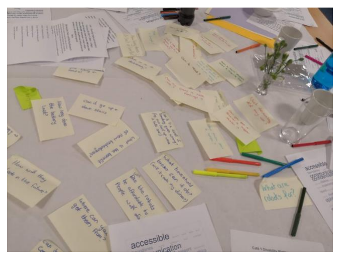
Figure 1 - Sharing Questions

In our table groups, we began conversations about robotic technologies and our experiences. We jotted down our questions on the tablecloths and then shared them in the whole group.