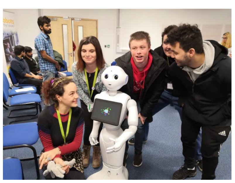
Figure 4 - A cool buddy, or guide?

We thought Pepper the robot was cool and could do some things for us or help us do our jobs. Its appealing, its without stigma. Pepper might act as a buddy, guide or companion. Pepper was hard to work with in a room with lots of people talking. Robots can learn to understand what each of us want like a human can, but a robot could also be too much like a human and be frightening!