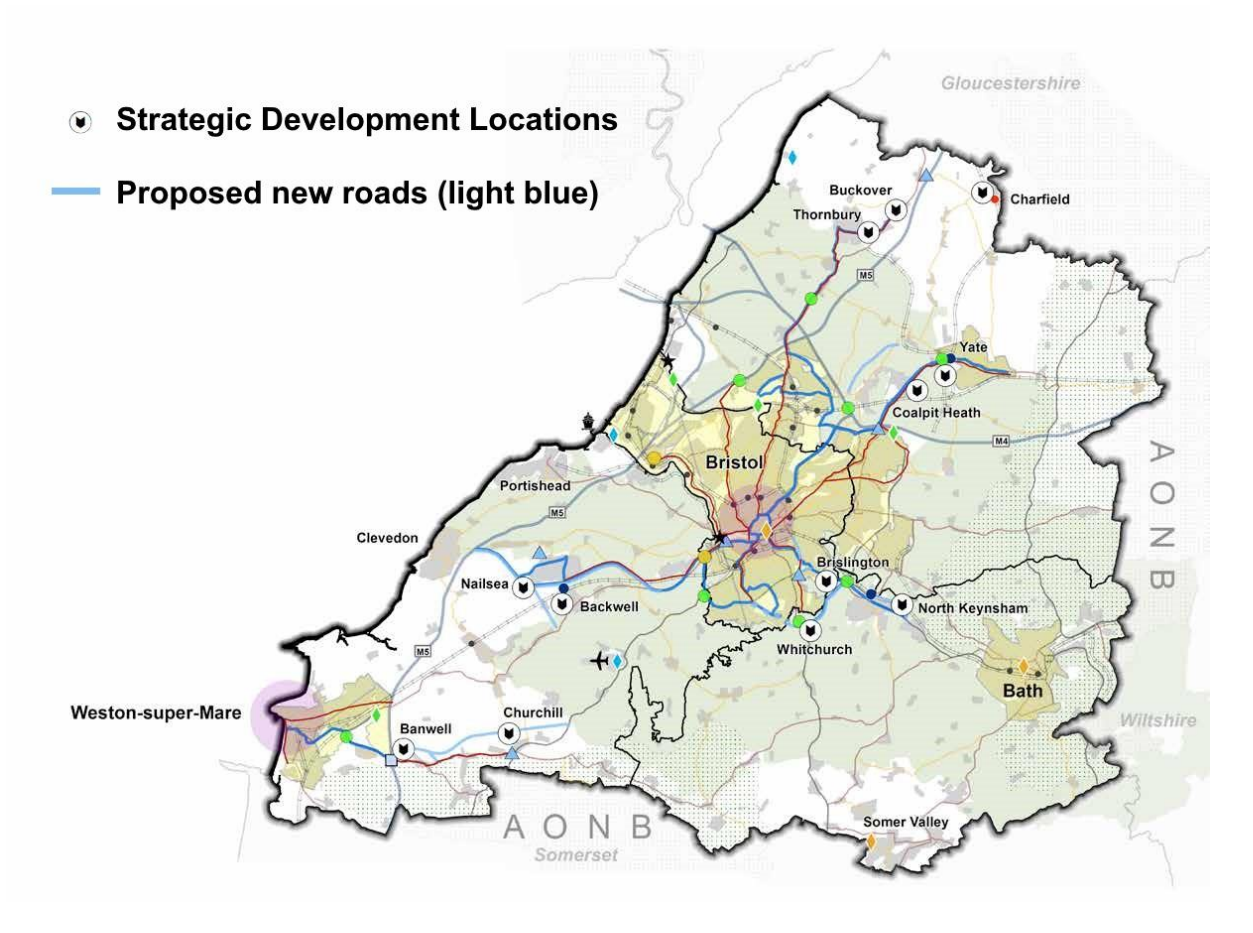
Figure 3 – Key Diagram, Showing Planned Developments and New Roads from WoE Authorities (2017a p. 51)

Green belts around (some) cities have been an important element of planning policy in the UK since 1947. Current national planning policy has a strong presumption against most forms of development within green belts, particularly housing development, but with an exemption for transport and some other forms of infrastructure (MHCLG, 2018b). Following that presumption, and a consultation exercise, Figure 3 shows housing development distributed around villages and small towns immediately outside the green belt. Several new roads, and road widening schemes, were planned to link the new housing to Bristol and the motorway network. The Spatial Plan was recently rejected by planning inspectors following an Examination in Public. Their grounds were mainly procedural, although some of their comments hint at concerns about the strategic development locations (Rivett and Lee S., 2019). The authorities are now reconsidering their strategy.