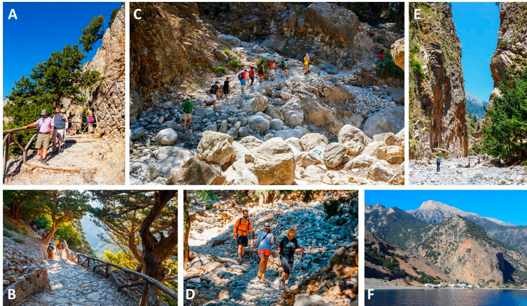
Figure 2. Impressions of the Samaria Gorge walk. Over the first kilometers, participants descend a narrow switchback path, which is partly bordered by a wooden handrail. (A,B). A large part of the walk is through rough terrain, i.e., the slippery stones of a dried-up riverbed. In winter, the riverbed is filled with water, but in summer the river has mostly dried up. Participants cross the riverbed several times, sometimes aided by wooden improvised bridges. As is evident from (C,D), there is no paved road but participants have to follow a trail through a rocky valley. Samaria is the main resting place for most participants, as this uninhabited tiny village contains benches in the shade, a water tap point and a medical post. Through the last part of the walk, the cliffs become higher and narrower. At its narrowest point, called the "Gates", the Samaria Gorge is approximately 4 meters wide, while the cliffs rise over 300 m high (see E). Thereafter, the final fairly flat part of the walk ends in Agia Roumeli at the seaside (see F). Participants can relax, eat and drink in the taverns, and recover from the walk. From Agia Roumeli, a ferry brings the participants to Hora Sfakia in about 1 hour. From there, coaches leave at 18:00 to bring the participants back to their accommodation.

The Samaria Gorge walk is 15.8 km long. It starts in Xiloskalo at an altitude of 1230 m and ends in Agia Roumeli, a small village at the Libyan Sea. Agia Roumeli can only be reached by walking the Samaria Gorge or by boat. The actual walk through the Samaria Gorge is about 12.8 km long, and after the end of the gorge, it takes another 3 km of walking to reach Agia Roumeli. Hence, participants walk 15.8 km in total, starting at an altitude of 1230 m, slowly descending to sea level in Agia Roumeli. The first part of the walk is 3.8 km long with a 580 m descent, followed by 3.7 km with a 310 m descent. Thereafter, the decent is less steep (3.6 km with a decent of 170 m). The last 4.7 km has a decent of 170 m towards sea level. An impression of the Samaria Gorge walk is given in Figure 2.