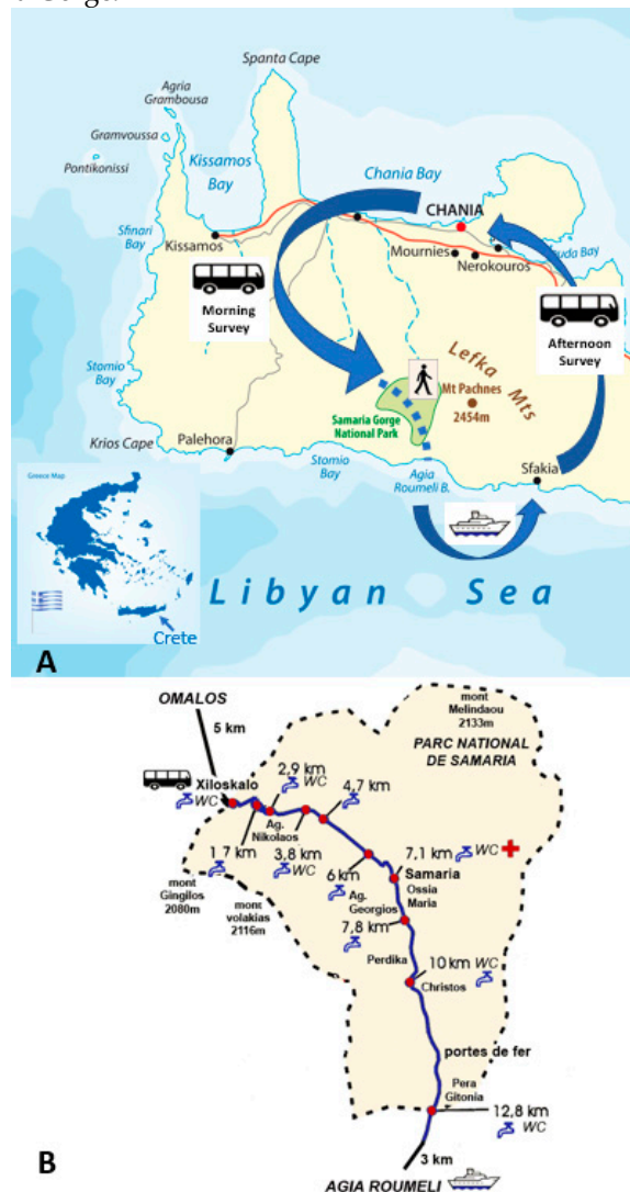
Figure 1. Schematic representation of the day tour and Samaria Gorge walk. (A) is adapted and used with permission from www.depositphotos.com . (B) is adapted and used with permission from Psarakis Travel Agency ( www.parakistravel.gr ).

Figure 1A schematizes the day tour of the participants. They were picked up at their accommodation between 06:15 and 06:45 in the morning. Participants had booked their day-excursion to the Samaria Gorge either from Chania ( n = 2 excursions), Rethymnon ( n = 4 excursions) or Herakleion ( n = 3 excursions). Depending on their city of residence, they arrived at the Samaria Gorge after a bus drive of approximately 2 to 3 hours: Chania (08:35), Rethymnon (09:00) or Herakleion (09:15). From Hora Sfakia, all busses returned to the participants’ accommodations in the afternoon at 18:00. Figure 1B shows the several resting locations where participants could drink water during the walk. These are simple tap points, as there are no inhabited villages or stores from which to buy refreshments in the Samaria Gorge.