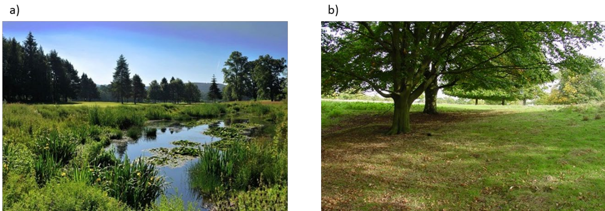
Figure 2. Example of images used in the Implicit Association Test (IAT). a) Greenspace with SuDS, and, b) greenspace without SuDS.

125 residents were surveyed in each location. This resulted in a final sample of 110 respondents for NGP and 83 respondents for Benton, with both tests fully completed and valid.