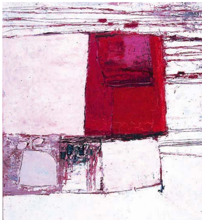
Small Harbour