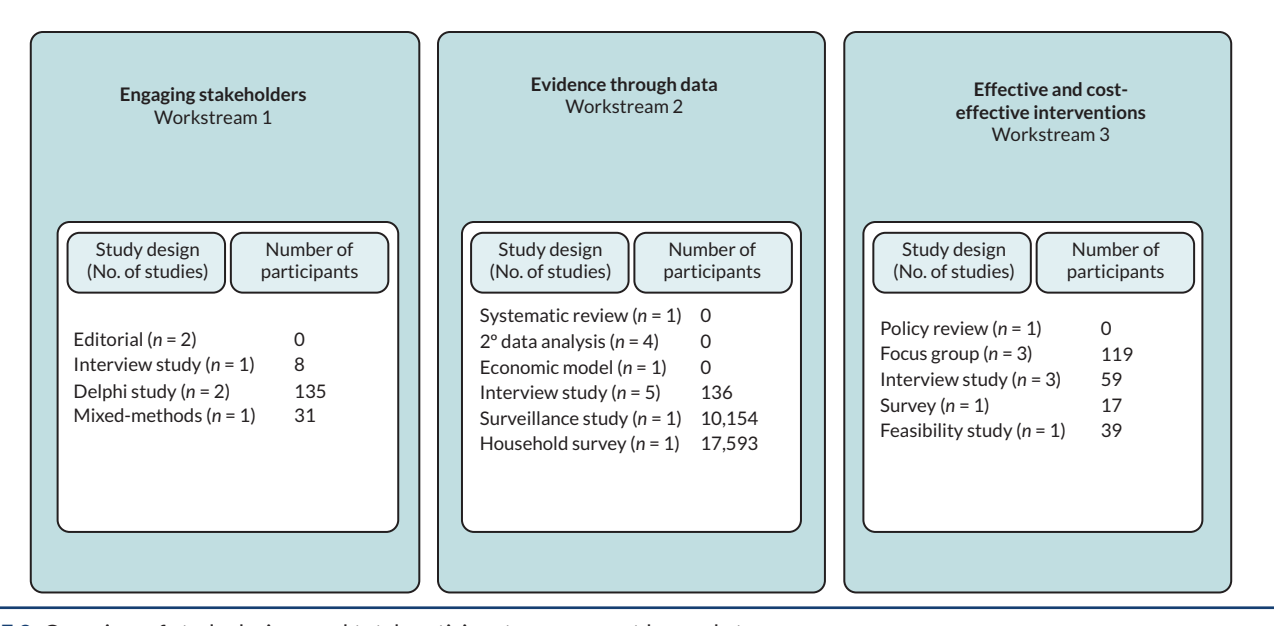
FIGURE 2 Overview of study designs and total participant engagement by workstream.

the 24 primary publications relate to workstream 2. The absence of robust routinely collected injury data creates a barrier to the assessment of the impact of interventions unless bespoke outcome data collection systems are established. Activities in workstream 3 (effective and cost-effective interventions) focused primarily on the