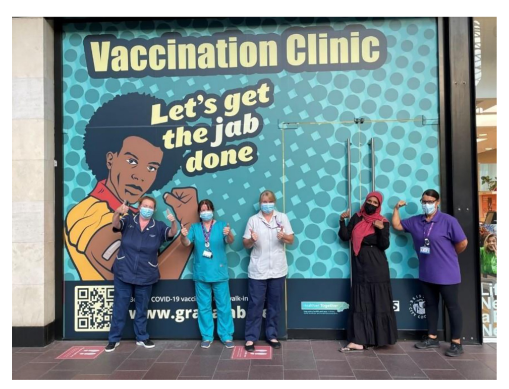
Fig 3. Example poster created by the BNSSG CIE team to encourage Covid-19 vaccine bookings in BNSSG, displayed at the front of a vaccination clinic inside Cabot Circus Shopping Centre in Bristol, UK.

https://doi.org/10.1371/journal.pone.0309230.g003