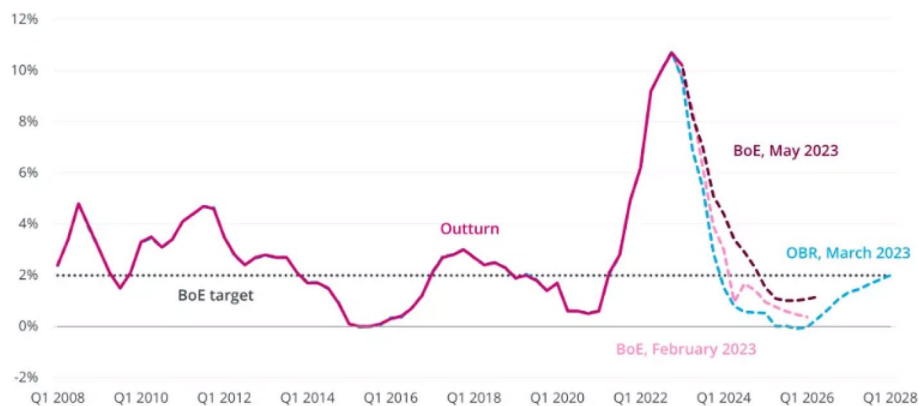
Fig. 2 CPI inflation Q1 2008 to Q1 2028, including successive Bank of England and Office for Budget Responsibility forecasts.

particular, the cost of housing, food, energy, and fuel [13]. For example, evidence suggests that 14.4% of households in the UK (approximately 3.53 million) will be living in fuel poverty by January 2023 [14]. Those at risk include large families, lone parents, and pensioner couples [15], with the elderly and children being most vulnerable to an increased risk of physical illness such as respiratory infections [16]. In addition, studies have found that economic hardships increase the prevalence of mental illness, including feelings of anxiety and depression [17]. The modest economic growth, the decline in real disposable income, and the slow recovery expectations will put more pressure on hospital admission from respiratory and mental illnesses.