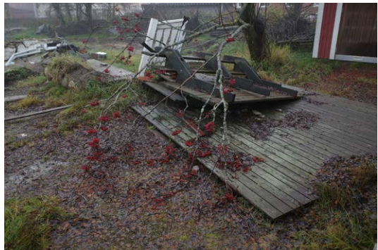
[Figs 11-12] Robin Serjeant, "After the house move.", Umeå: Teg, December 2021

Landscapes of care are manifest through the combined process of film, photography and projection. In the physical space of the region, these landscapes are made by the house movers (Magnus Mårtensson and Nya Töre Husflyttningar) with their understanding of the histories and weight of built form on land. They effect careful manoeuvring across highways, bridges and between narrow village roads, through seeking permissions and marking obstructions, of high-level communication cables, bus stops, trees and more. They are custodians through the move of three generations of home owner/dwellers.