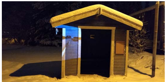
[Fig. 4] Tonia Carless and Robin Serjeant, "The journey of the house back along the ten kilometre route projection: Bus stop with housemover flag 'to be moved'", December 2021