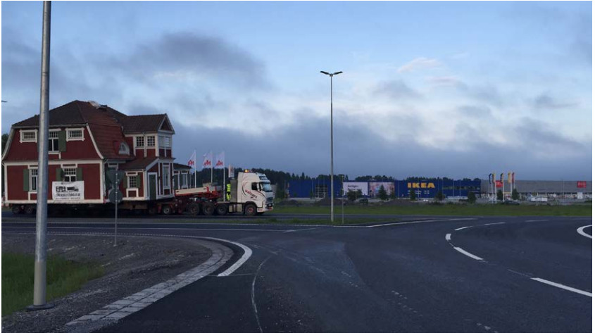
[Fig. 3] Tonia Carless, "House passing Ikea", 21 June 2021