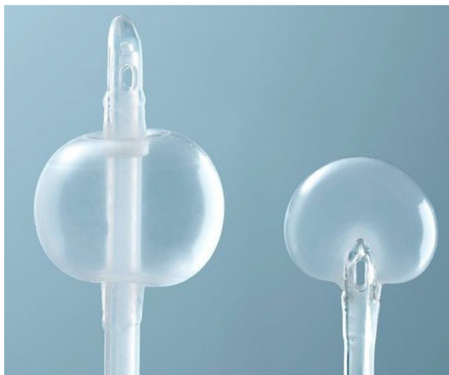
Fig. 1. Comparison of the tips of the standard Foley catheter (left) and the FLUME catheter (right). The FLUME catheter has less foreign material in the bladder and places the drainage eyeholes close to the bladder neck. With the retaining balloon inflated, it envelops the catheter tip, so the bladder wall is protected. The Foley has a prominent tip, which can cause discomfort and places the eyeholes near the bladder wall where they may aspirate the mucosal tissue and get blocked.