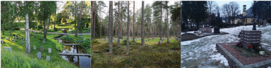
Figures 1–3. Examples of cemeteries in Scandinavia. From the left to right: photos from the main cemetery St Eskil in Eskilstuna; woodland cemetery Röbbäck in Umeå; collective memorial at the central cemetery Bragenes in Drammen, the yellow building in the back is the crematorium.