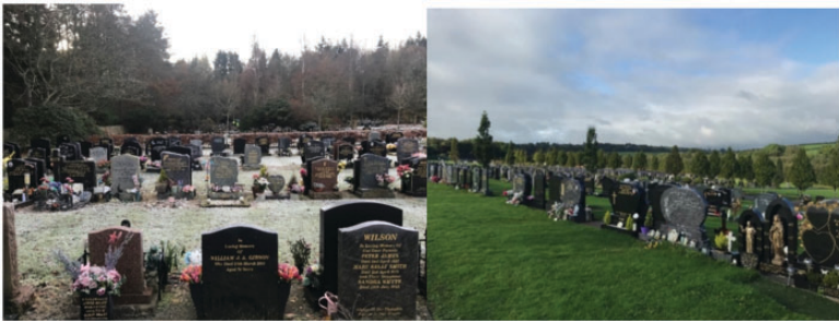
Figures 4–5. Examples of cemeteries in Ireland and Scotland. From left to right: photos from Birkhill cemetery in Dundee; St James’ cemetery in Cork.

As places of mourning, bereavement, and consolation, cemeteries and crematoria gardens accommodate personal as well as social and environmental functions (Jedan et al., 2019). The meaning of the individual/private grave, and how it is shaped and decorated, is of importance for mourning and remembrance (Pettersson & Wingren, 2011). Further, interactions with ‘deathscapes’ are not just experienced through the materiality of physical spaces, but also and at the same time through embodied-psychological experience and various forms of virtual space, including both digital spaces and arenas of belief and belonging, such as idea of ‘heaven’ (Maddrell, 2016). This embodied experience of loss, mourning, and consolation is also frequently reflected in a sense of a continuing bond with, and/or responsibility to, the dead (Klass et al., 1996; Klass & Steffen, 2018). This highlights the complexity of emotional-affective environments, particularly those connected to the disposition of the dead, mourning, and remembrance, and how this is culturally inflected. This in turn demonstrates the social and cultural significance of cemeteries and crematoria gardens, and the importance of their organisation and management, including their diversity-readiness .