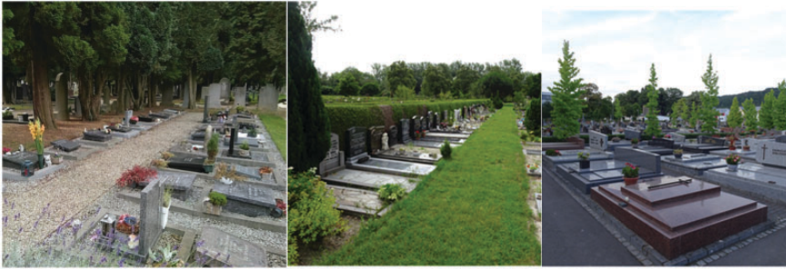
Figures 6–8. Examples of cemeteries in The Netherlands and Luxembourg. From left to right: photos from Tongerseweg municipal cemetery in Maastricht; municipal cemetery Noorderbegraafplaats in Leeuwarden; Notre Dame in Luxembourg-City.