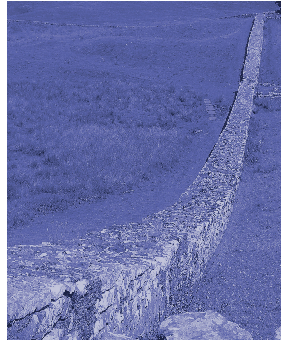
Roman Limes Hadrians Wall.