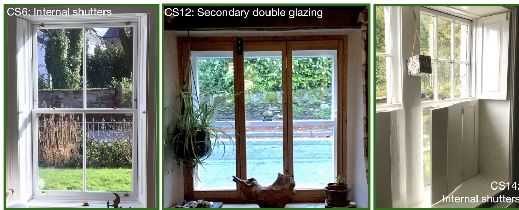
FIGURE 2. Internal shutters and secondary glazing in different cases.