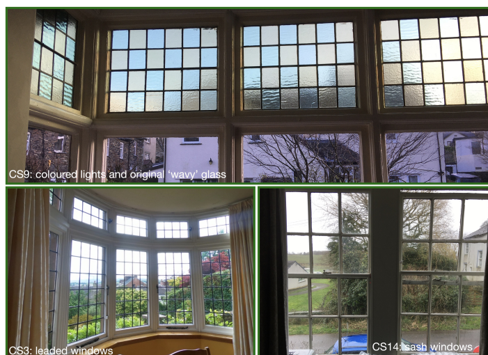
FIGURE 1. Original windows.

World Heritage Site which has additional planning restrictions.