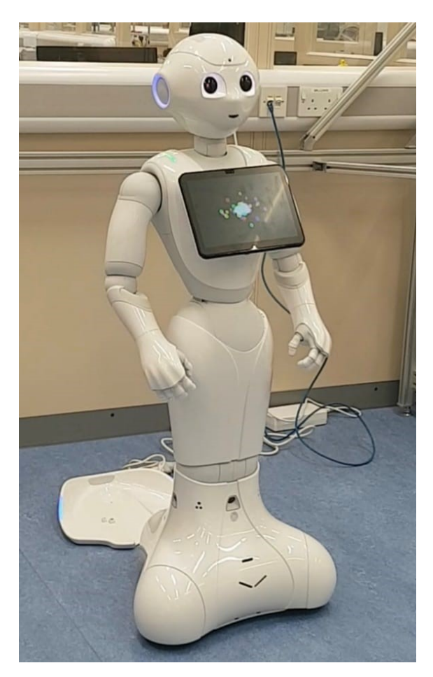
Figure 1. Social robot Pepper.