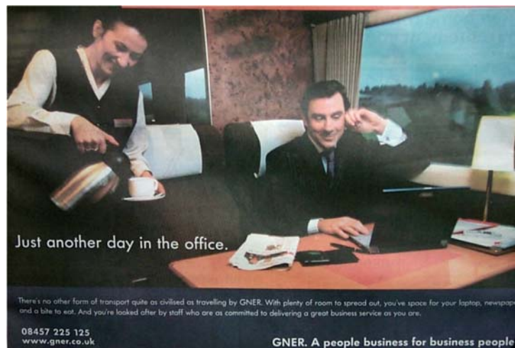
Figure 2: Newspaper advertisement by train operating company (GNER)

Collective transport operators show some signs of action to capitalise on the potential advantage they have over the car in terms of productive use of travel time. The newspaper advertisement shown in Figure 2 aptly illustrates this. The new Virgin Voyager trains have power points for laptops in standard class as well as first class. In short, longer durations of travel by collective transport compared to the car need not be as decisive a factor in mode choice decisions in favour of the car if people's awareness of the opportunity to use travel time productively is raised. Indeed there may also be a need for innovation and support in identifying new technological developments, vehicle designs and travel time use techniques and practices that can aid and encourage individuals to experiment with their use of time within the travel environment.