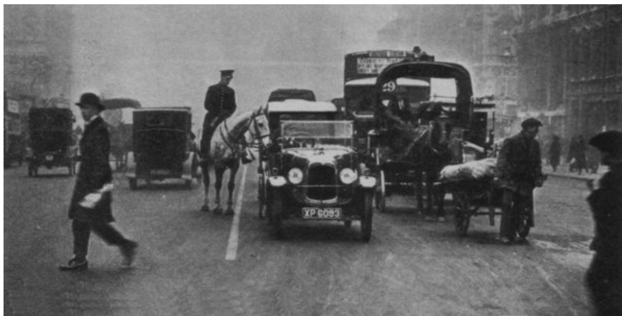
Figure 1. First white line in London (image reproduced from Morton, 1934)

In 1924 the first white line was laid down in a London street as an experiment in solving the traffic congestion problem, which was considered at that time to have become acute (see Figure 1). Further back still there were serious concerns that ‘pollution’ from horse-drawn traffic would leave London knee-deep in the consequences.