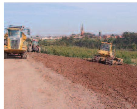
Figure 1 Appropriate use of soil materials is essential in any reclamation project.