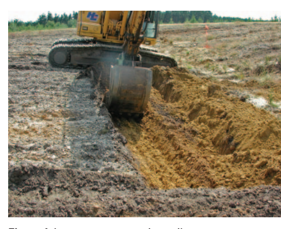
Figure 1 An excavator removing soil.

Best Practice Guidance for Land Regeneration