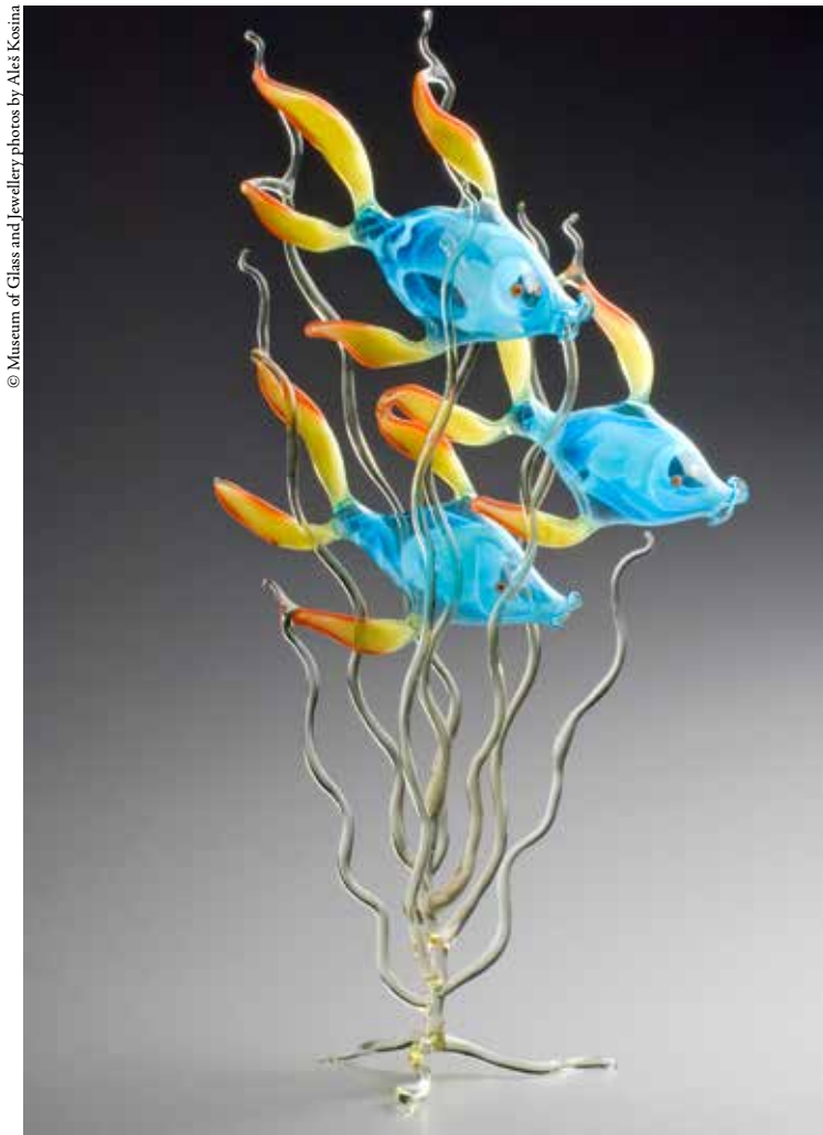
LEFT: Fig. 6 Jaroslav Brychta from the Aquarium collection, 19

Czechoslovak form that becomes incorporated in the official Communist design narrative. (figs 5 & 6)