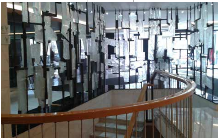
BELOW: Fig. 11 Hotel International , Brno, Jaroslava Brychtová and Stanislav Libenský's 1962 decorative glass screen