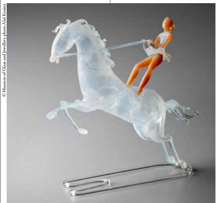
RIGHT: Fig. 2 Jaroslav Brychta from the Aquarium collection, 1933