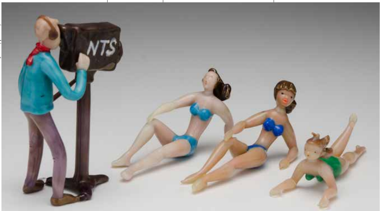
BELOW: Fig. 5 Cameraman and Girls in Swimsuits, after 1957 School of Železný Brod